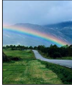
On the Horizon